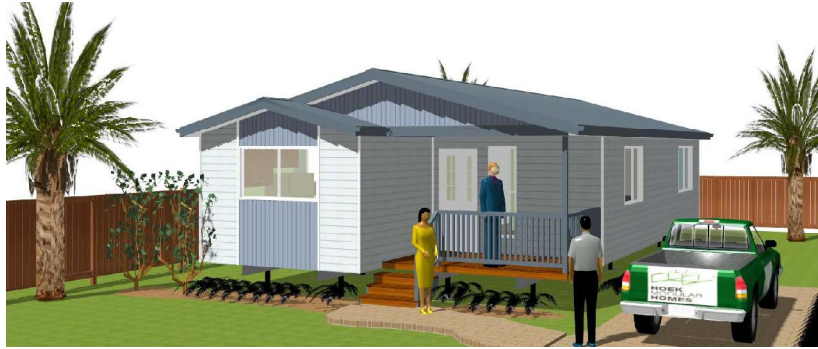
Standard Gable Facade

Another of our medium 2 bedroom designs because of its versatility. Available in two standard widths 7.2m wide as standard and 6.6m wide. With a large main bedroom, second bedroom perfect as a sewing and craft room or for when friends stay over. With a well appointed kitchen, comfortable bathroom with separate wc, laundry and linen cupboard, this home offers comfortable living with great versatility. Want to make changes to this design? Ask us about customizing to suit your needs.