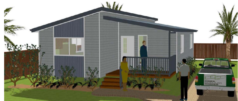
Optional Sawtooth Facade