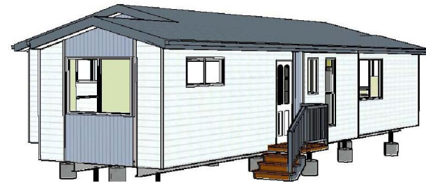
v3 66 Rear Gable Facade