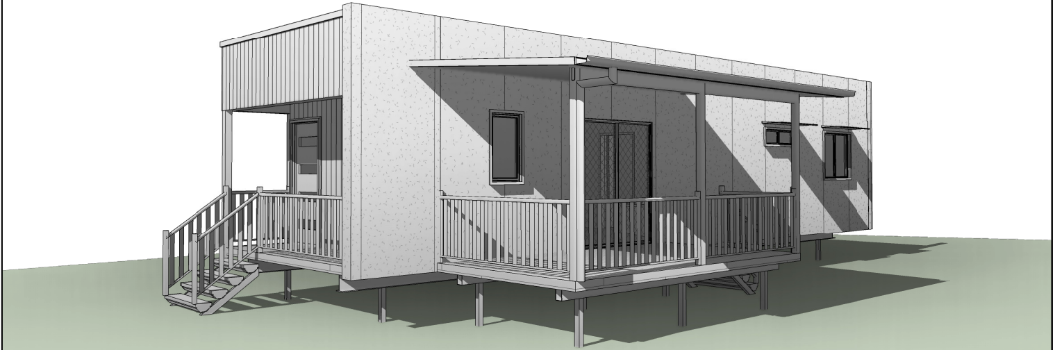
Illustration purposes only.