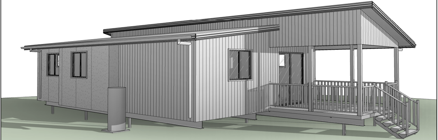
Illustration purposes only.