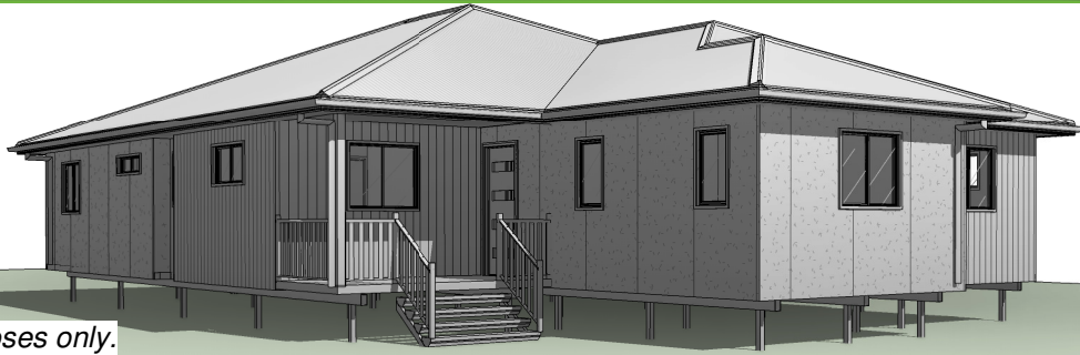
Illustration purposes only.