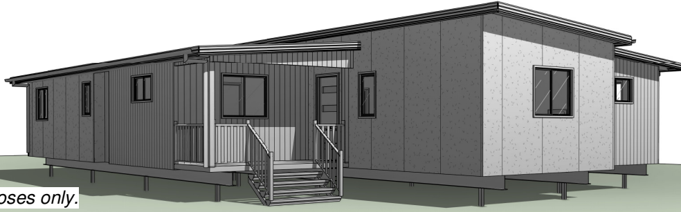
Illustration purposes only.