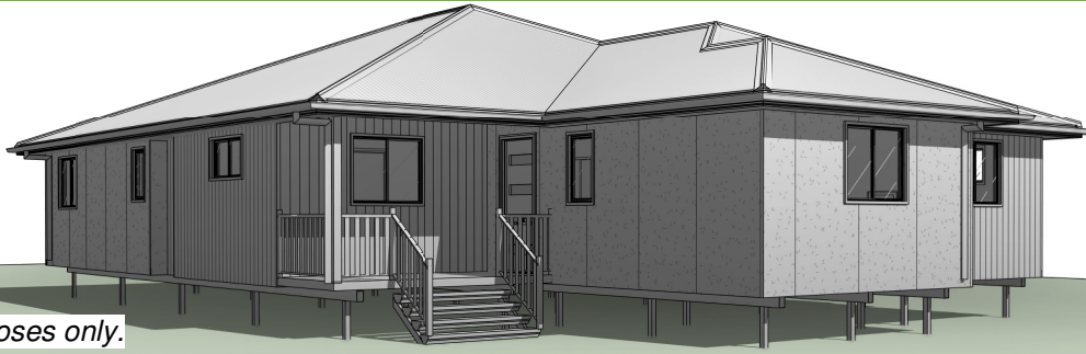
Illustration purposes only.