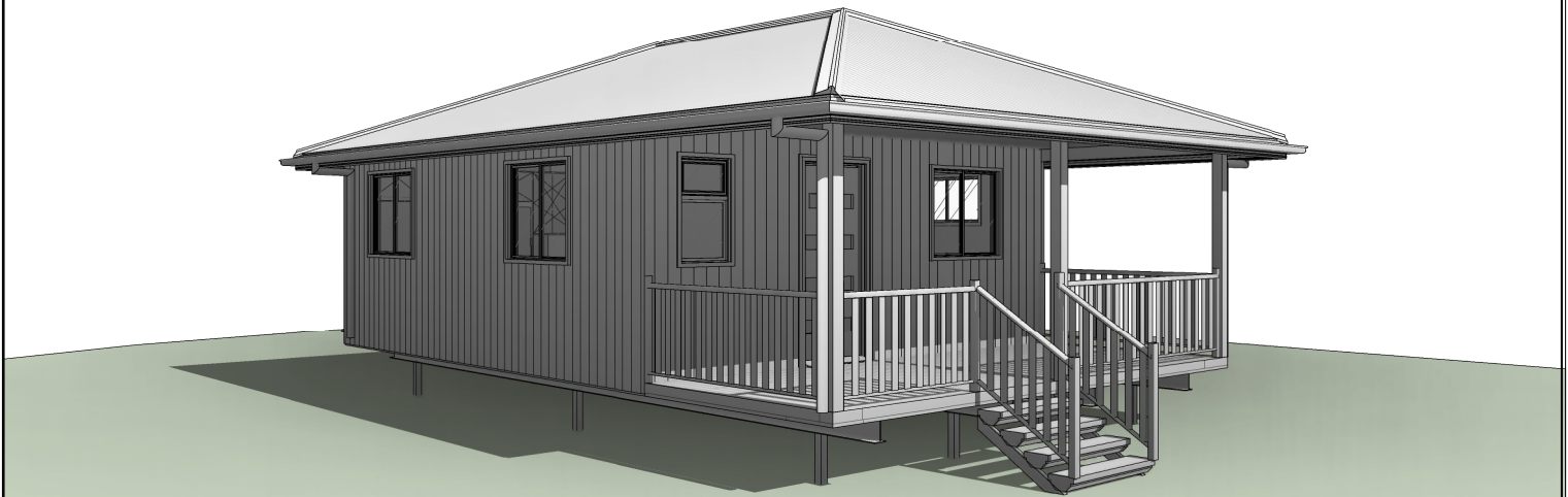
Illustration purposes only.