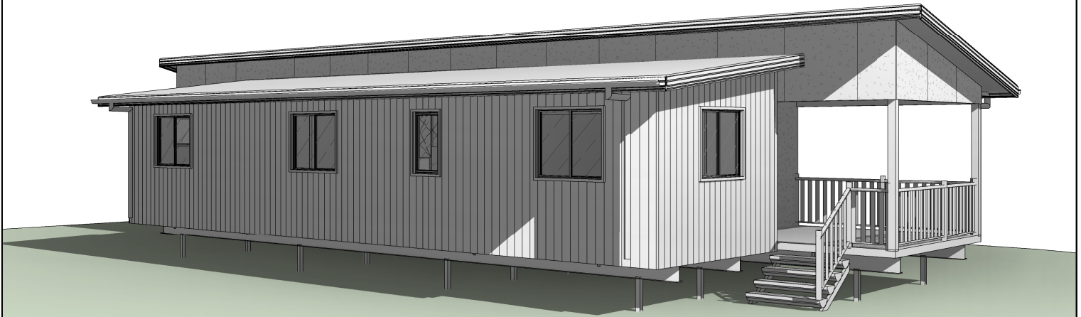
Illustration purposes only.