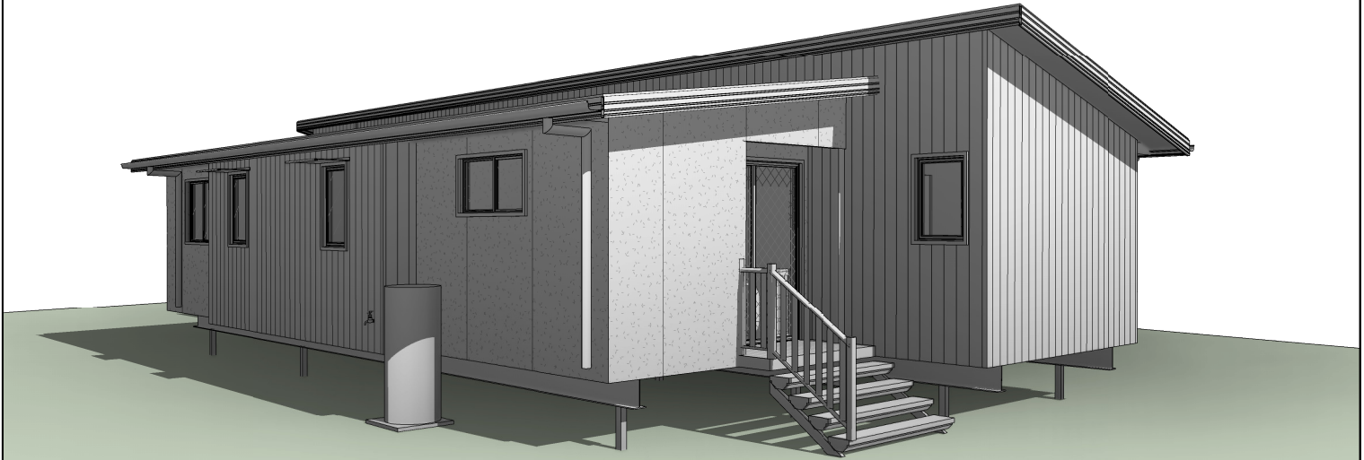
Illustration purposes only.