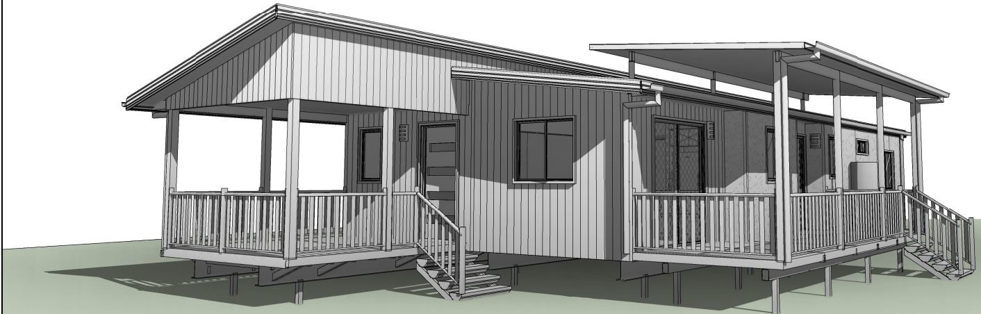
Illustration purposes only.