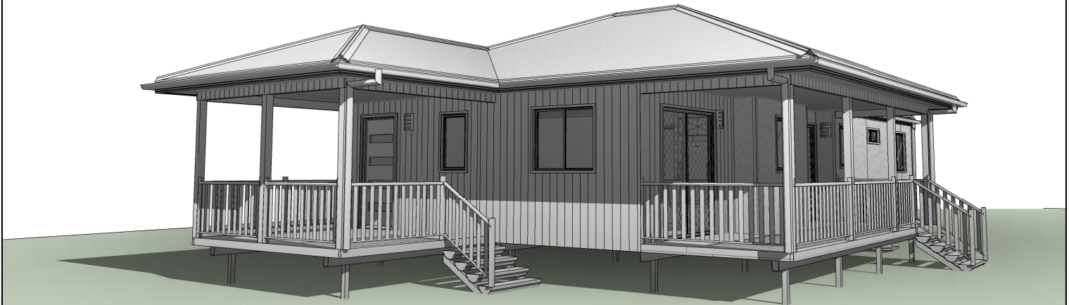
Illustration purposes only.