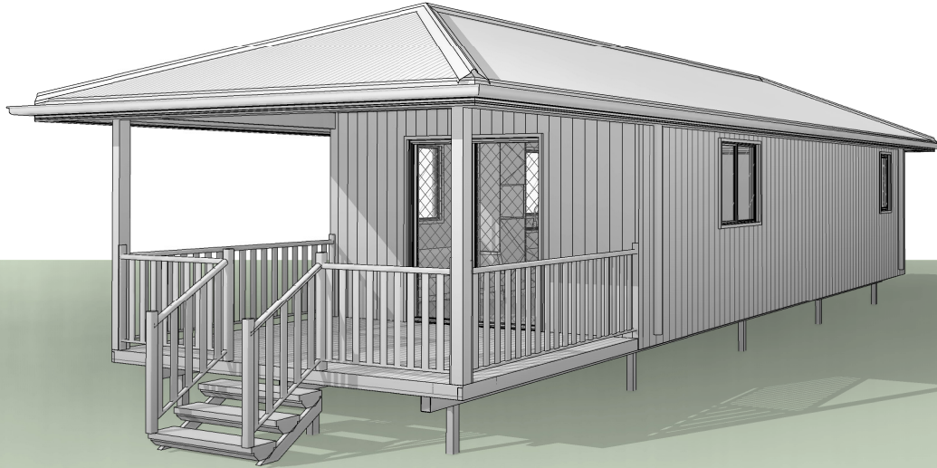
Illustration purposes only.