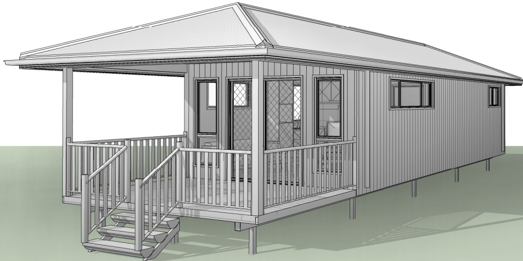
Illustration purposes only.