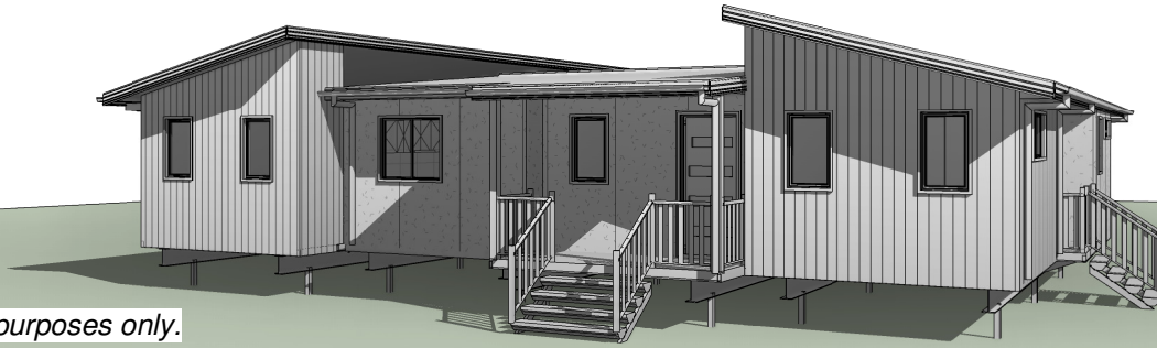
Illustration purposes only.