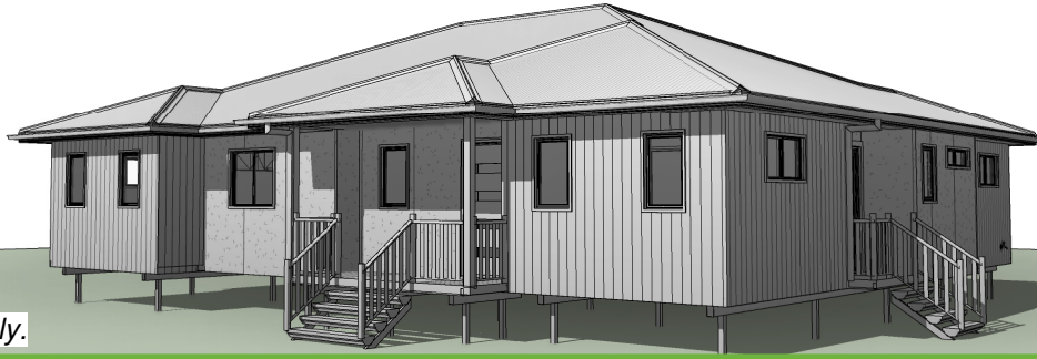
Illustration purposes only.